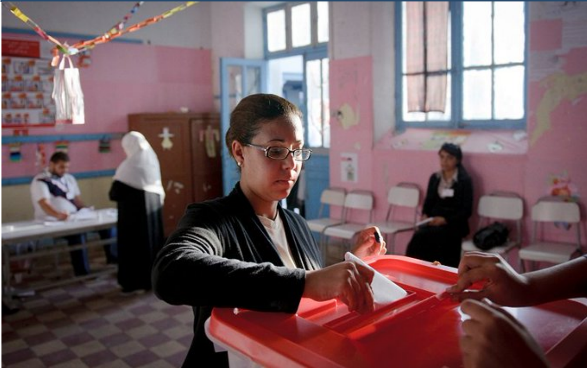
Voters in Tunisia.