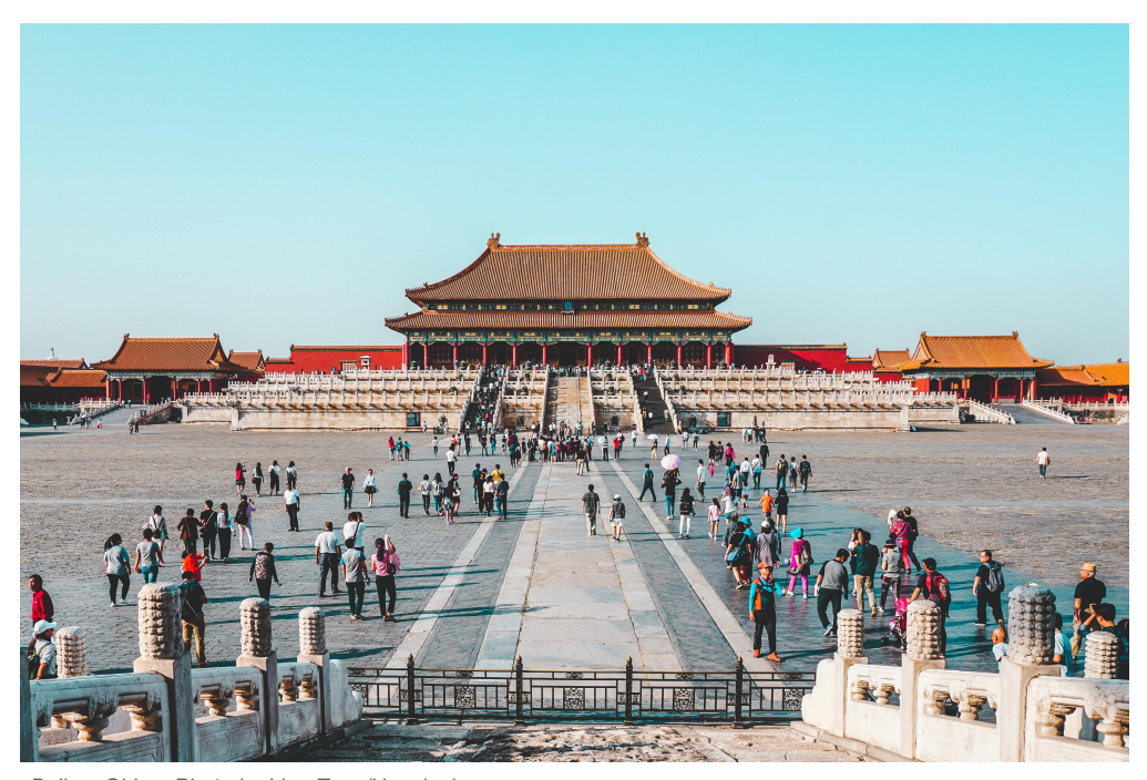
Bejing, China.

• In <u>The Party That Failed, An Insider Breaks with Beijing,</u> Cai Xia describes her disillusionment with the Chinese Communist Party. Xia explains how her