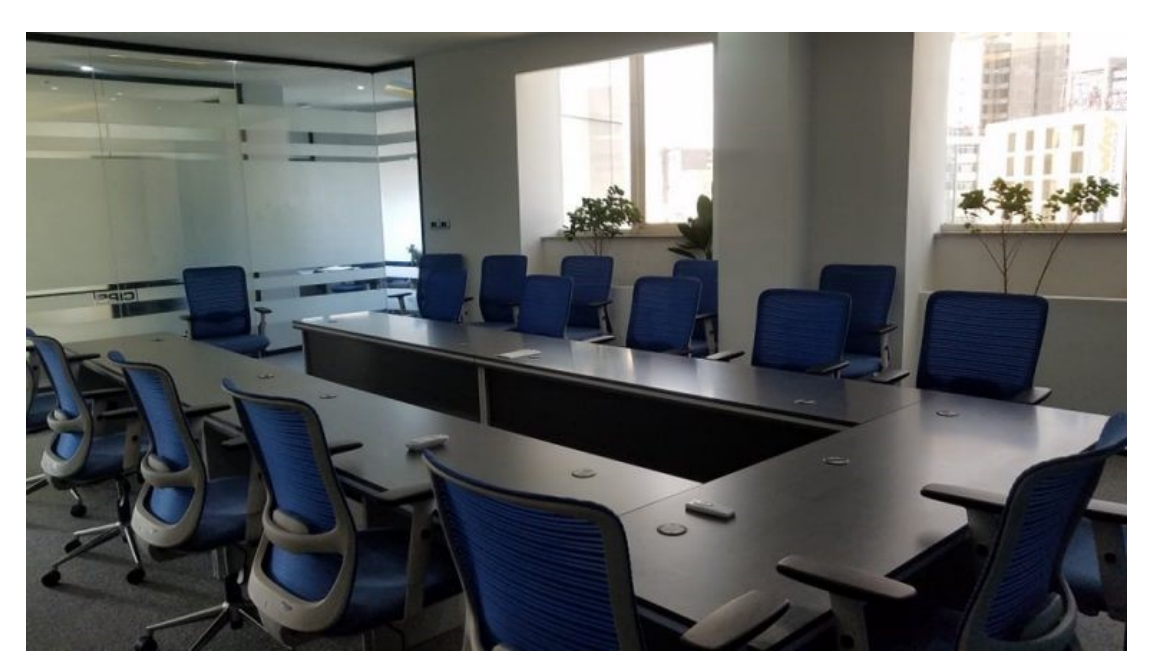
CIPE Civic Engagement Hub in Ethiopia